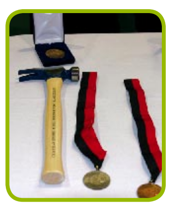
The coveted hammer and medals.